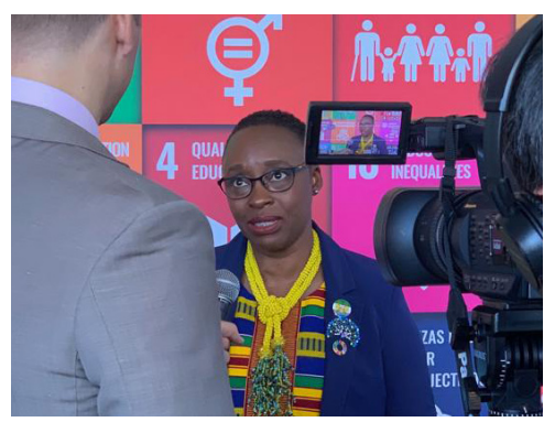
Minister Priscilla Schwartz speaks at the SDG Media Zone

Ms. Ramos explained the OECD's business case for people-centered justice which shows that countries can lose 3 percent of their GDP due to unsolved justice problems. "We need to address the justice system as a whole," she said.